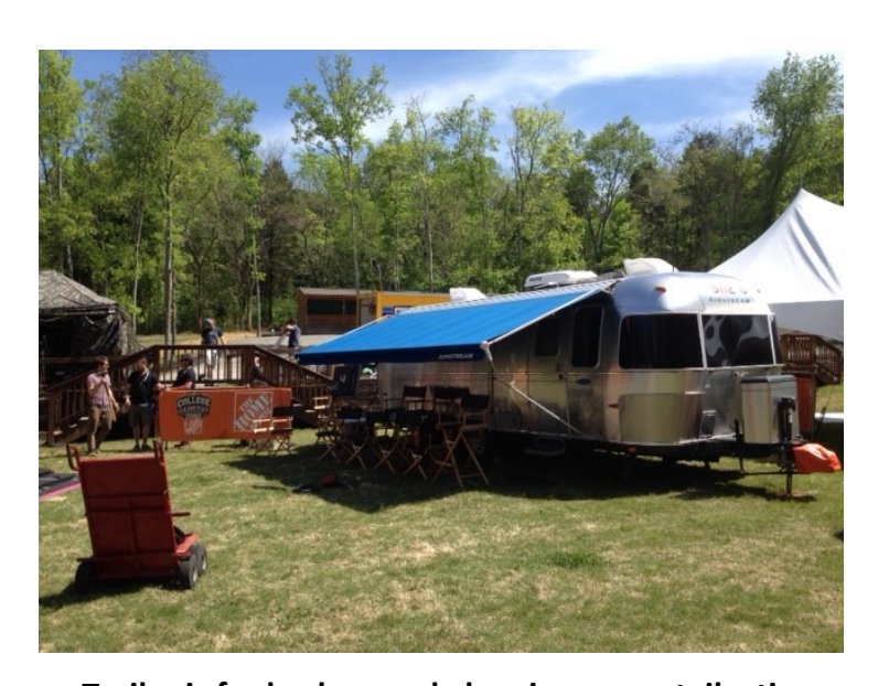
Trailer is for background-showing group tailgating.