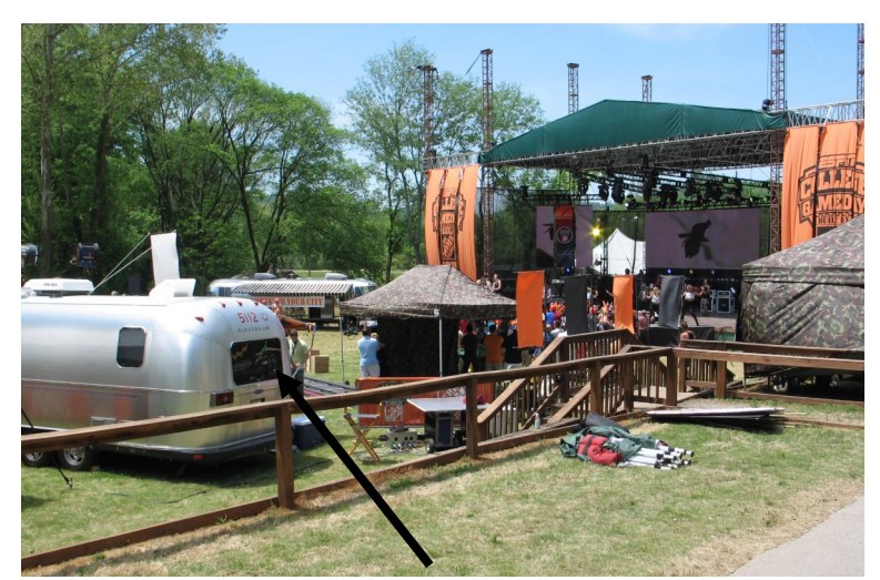
The Lee's Trailer