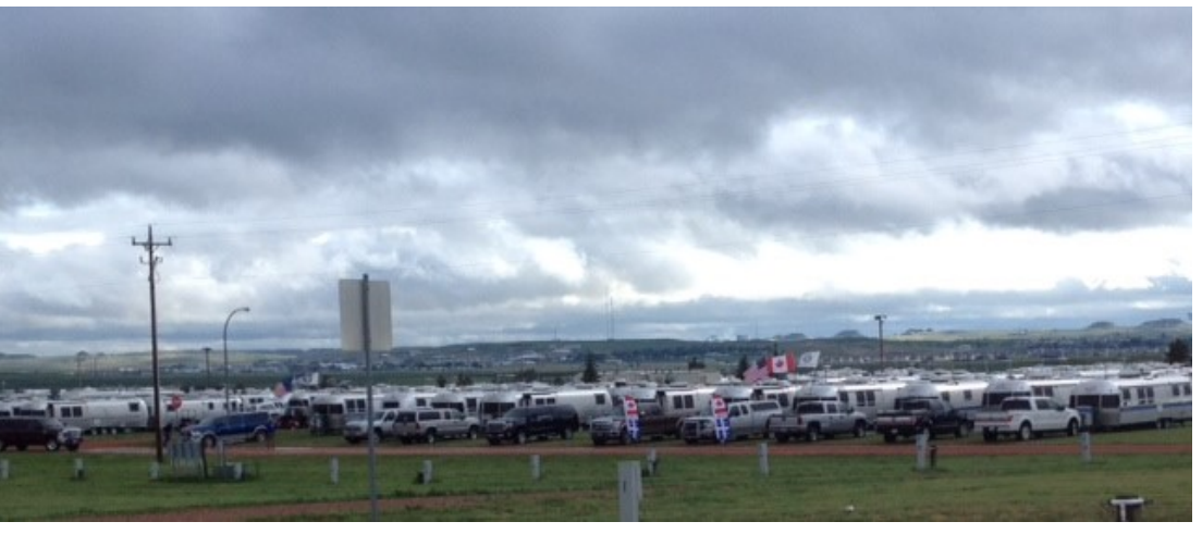
Approximately 300 trailers attended the International Rally.