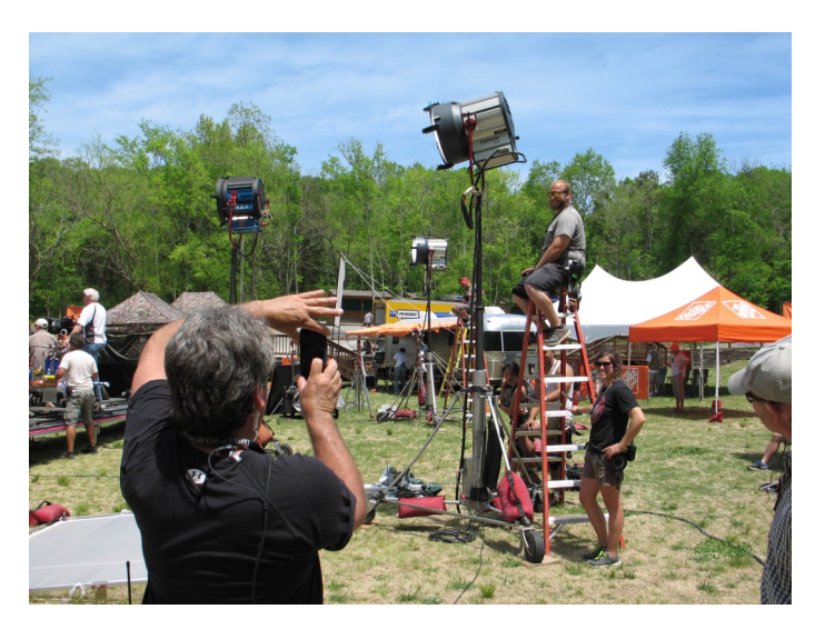
Shooting the Fontanel Video