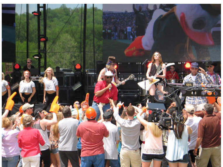
The Stage—Up Close