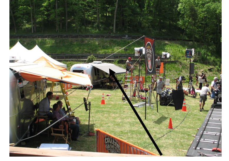
The Goffinet's Trailer